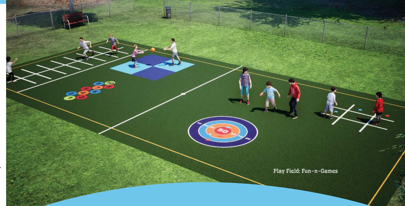
Play Field: Fun-n-Games