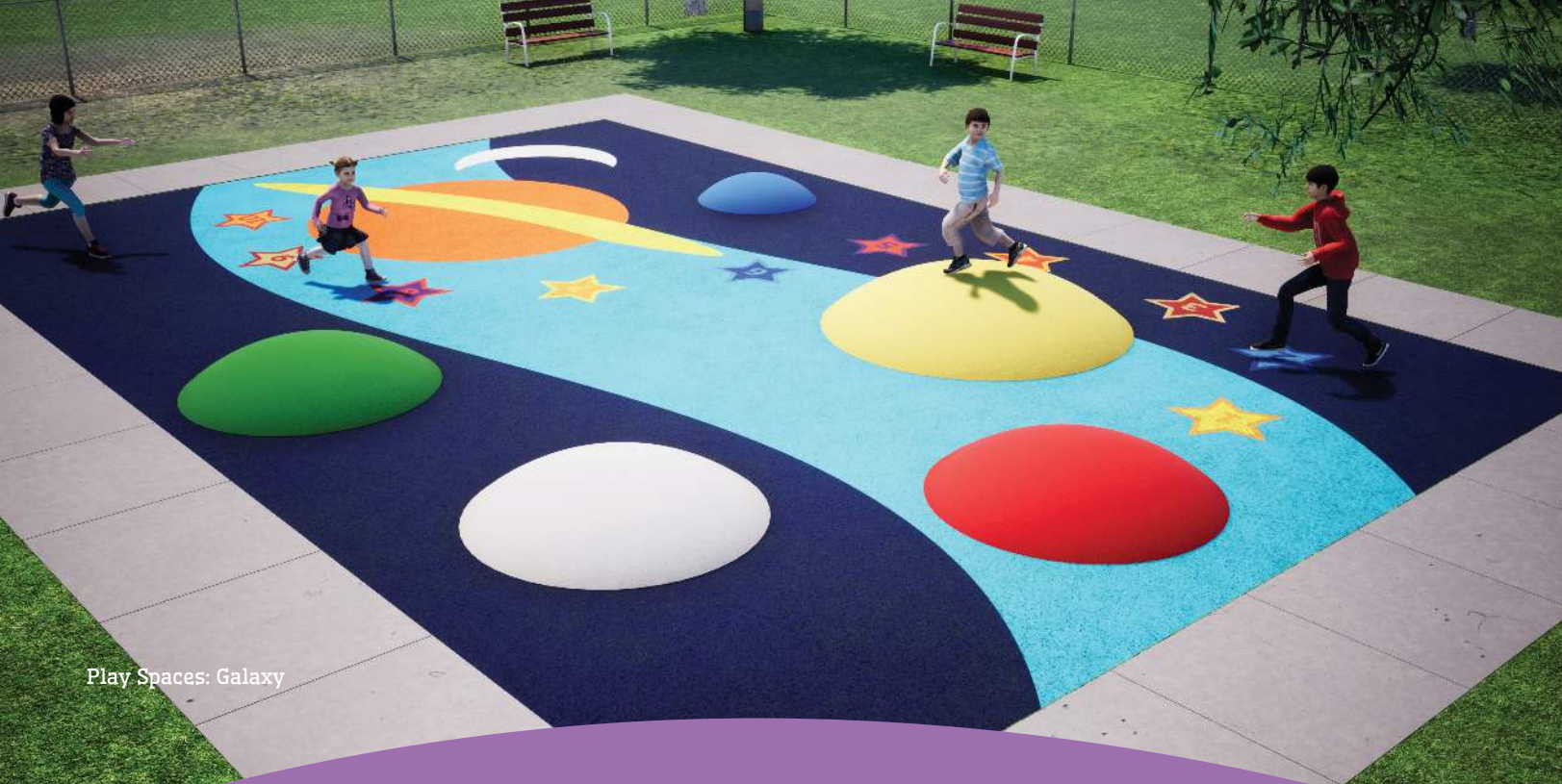
Play Spaces: Galaxy