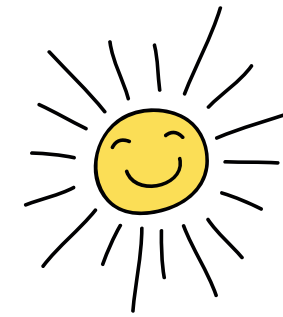
Chart a new course with Trike Paths